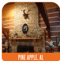
PINE APPLE, AL

Cedar Lake Lodge is the premier Trophy Deer Hunting destination in the south. Wind down after a long day at their gorgeous log cabin lodge.